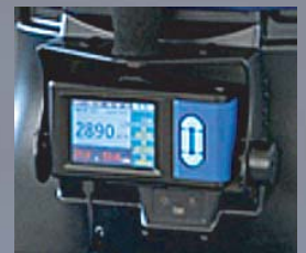
Full color backlit LCD tilts to be viewable from any angle