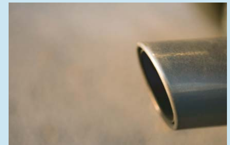
Engine Exhaust Testing