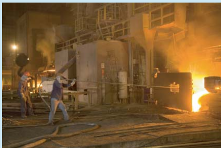
Checking worker exposure to airborne contaminants