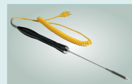
881602 surface probe