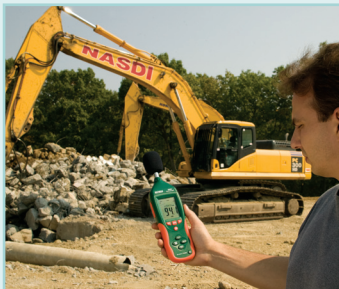
Meets new IEC 61672-1 Class 2 accuracy standard for OSHA and other local and national noise ordinances