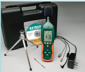
Meter and accessories are packaged in a rugged hard carrying case for added protection